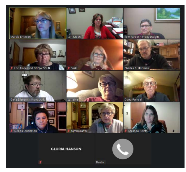
NESDCAP Board of Directors Conducting November's Board Meeting