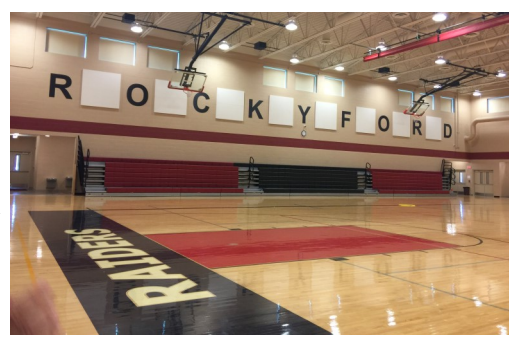
The model built Rockyford School gym

Completing the transactions utilized the expertise of several partners and investors in addition to the local School District.